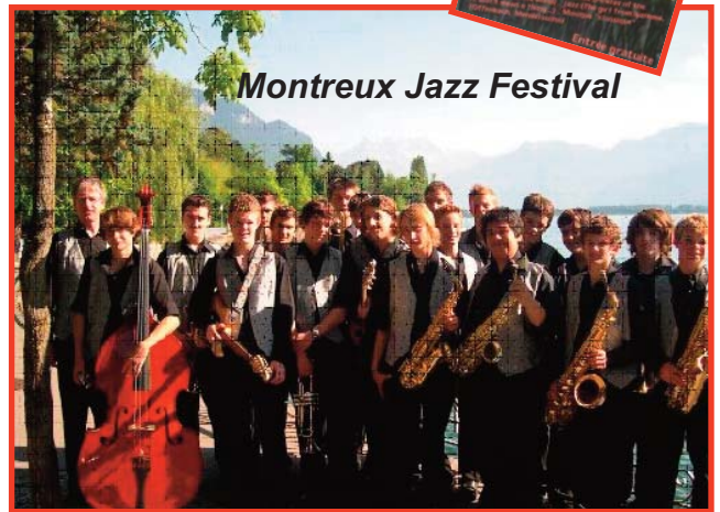
Montreux Jazz Festival