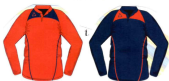
1. Reversible Red/Navy TBGS Rugby Shirt

In Sport and PE, we have very high expectations in terms of application, progress, performance, and enjoyment. This is also reflected in appearance, and students wear a quality, modern PE kit (available from Pro:Direct, Riviera Schooldays and the PA Pre-Loved Shop):