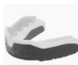
6. Mouthguard – can be purchased from school shop or any high street sports' retailer