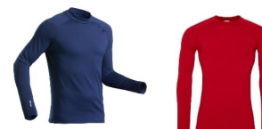
3. Navy/red base-layer top (between Oct half term and Feb half term)