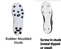
Rubber Moulded Studs