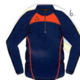
1. Navy/red TBGS 1/4 zip mid-layer