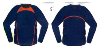
5. Navy/Red Waterproof Smock Top