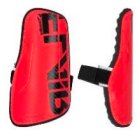
7. Shin pads – from high street